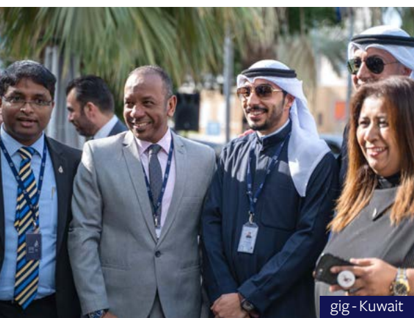
gig - Kuwait