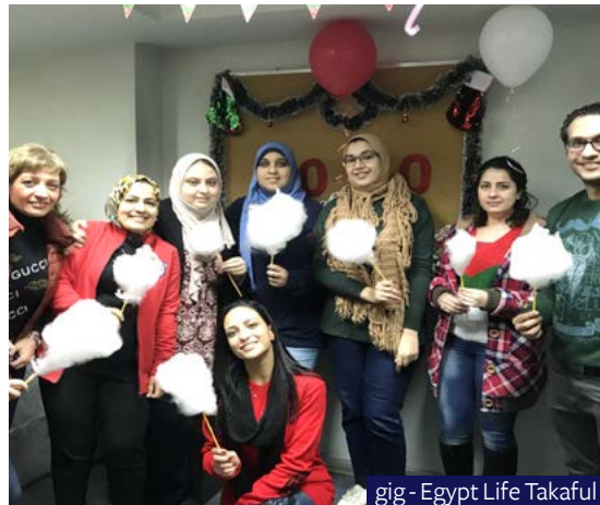
gig - Egypt Life Takaful