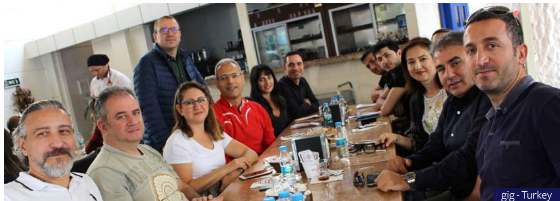
gig - Turkey