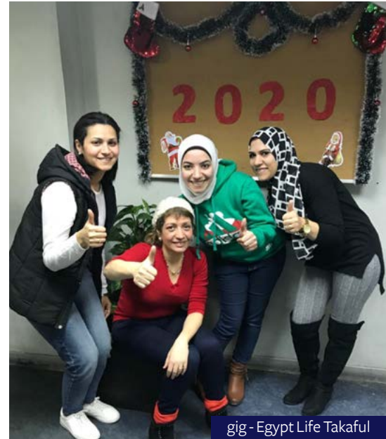
gig - Egypt Life Takaful