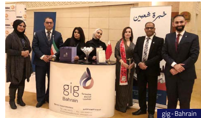
gig - Bahrain