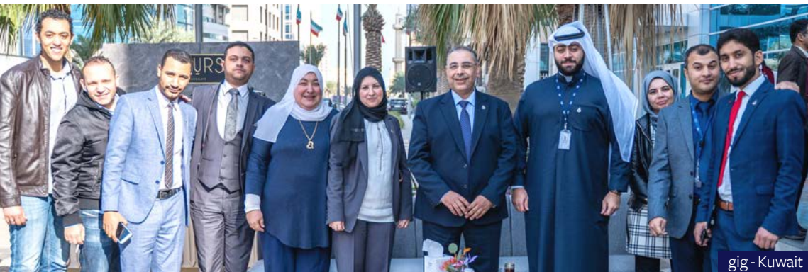
gig - Kuwait