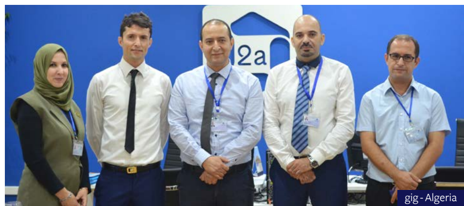
gig - Algeria