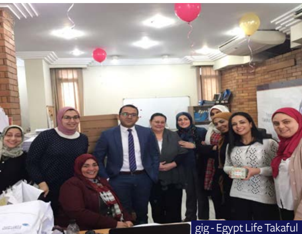
gig - Egypt Life Takaful