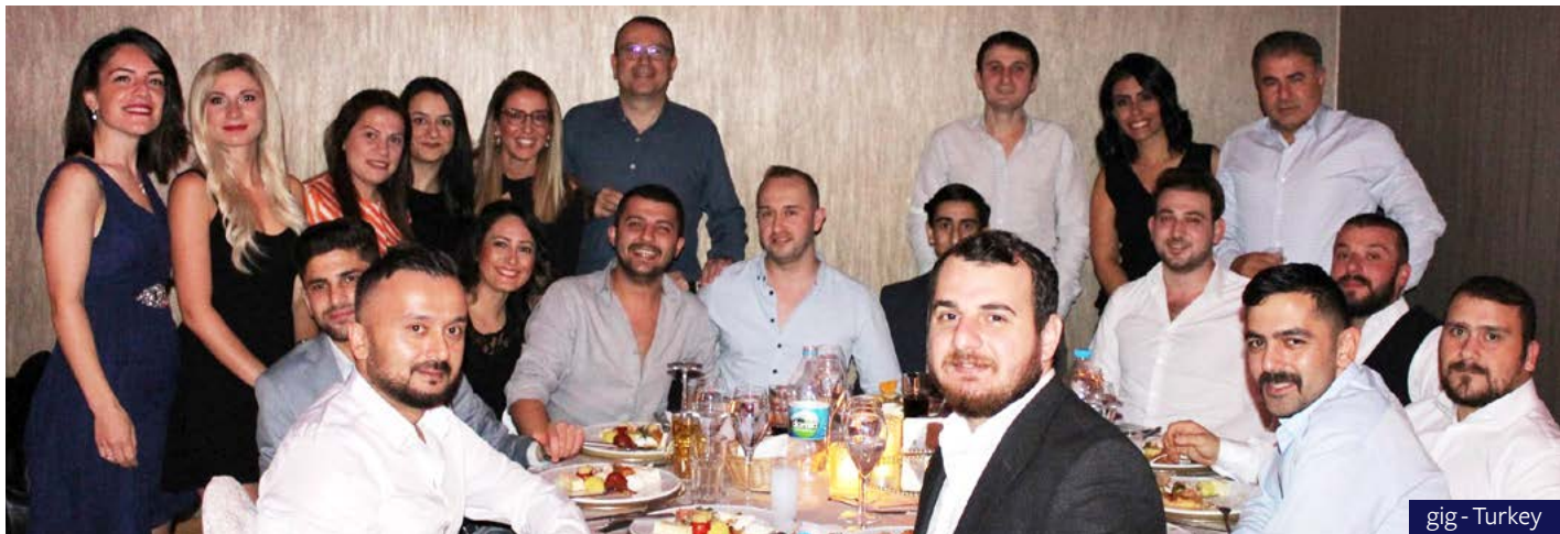
gig - Turkey