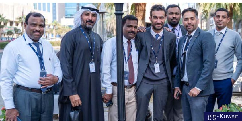
gig - Kuwait