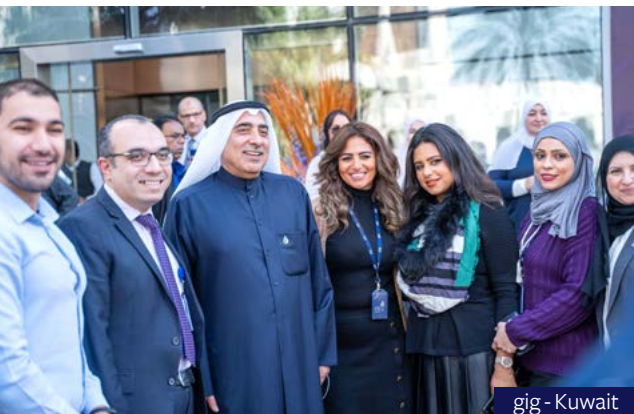
gig - Kuwait