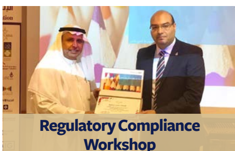
Regulatory Compliance Workshop

Group Corporate Communications & Investor Relations Department