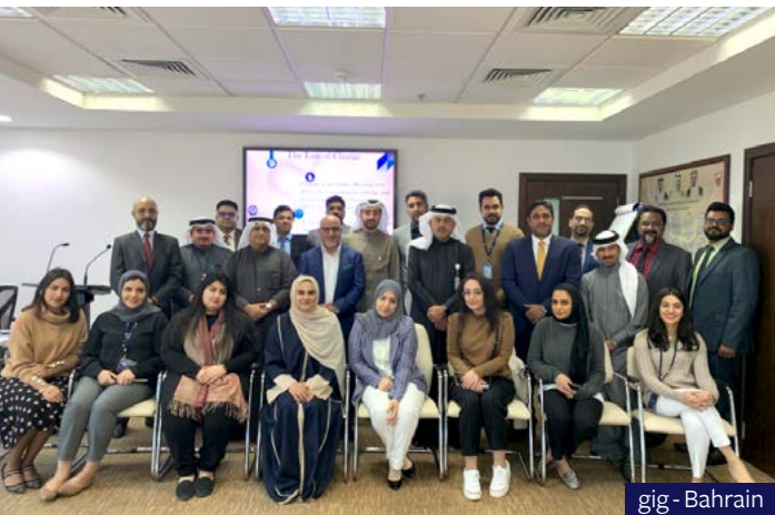
gig - Bahrain