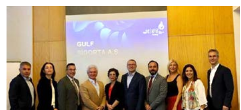
gig-Turkey Strategy Meeting

Gulf Sigorta Senior Management and gig-Turkey Board members gathered for a mid to long term strategy meeting in Istanbul, Turkey, on 17th September, 2019. During the meeting, general market dynamics, potential gaps and opportunity areas were discussed with a rough action plan that was drafted. Discussion topics included; immediate opportunities to be pursued with no additional investment, product innovation and ideas to expand existing portfolio profitably, as well as preliminary longer term expansion areas.