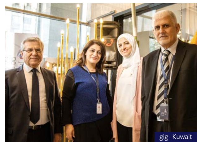
gig - Kuwait