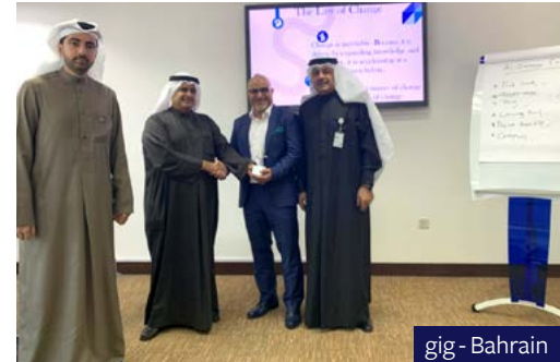
gig - Bahrain