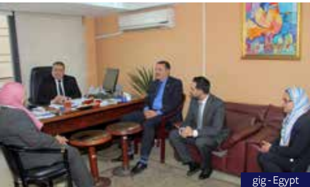
gig - Egypt