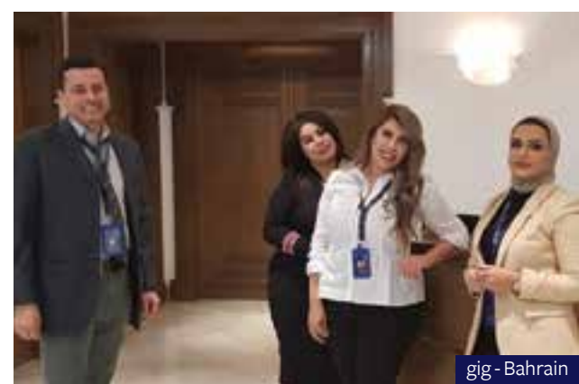
gig - Bahrain