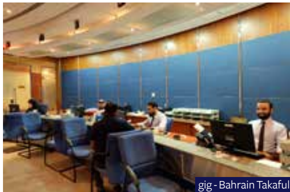
gig - Bahrain Takaful