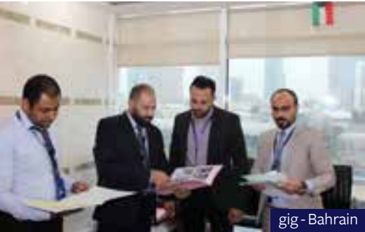
gig - Bahrain