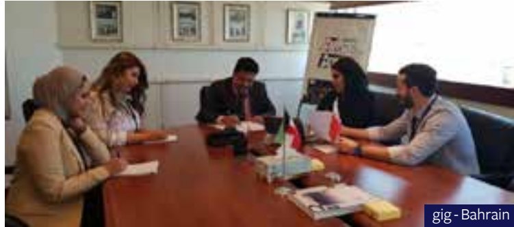
gig - Bahrain