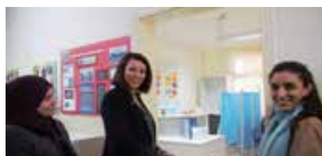
gig-Jordan furnishes medical clinics in public schools

Gulf Insurance Group had the pleasure to sponsor Dhuwa Al Yaddah children's cultural festival for the 3rd time. It exposed the importance of children today by encouraging national talent of young boys and girls. The event served many booths for children to visit which consisted of playing, learning and having fun.