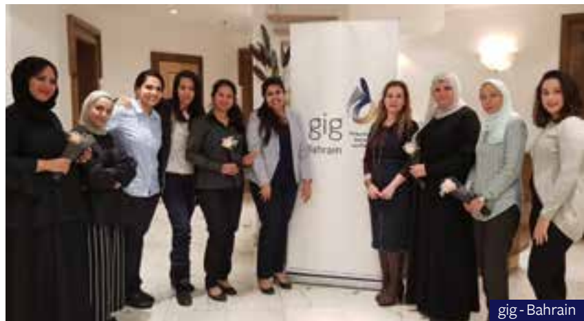
gig - Bahrain