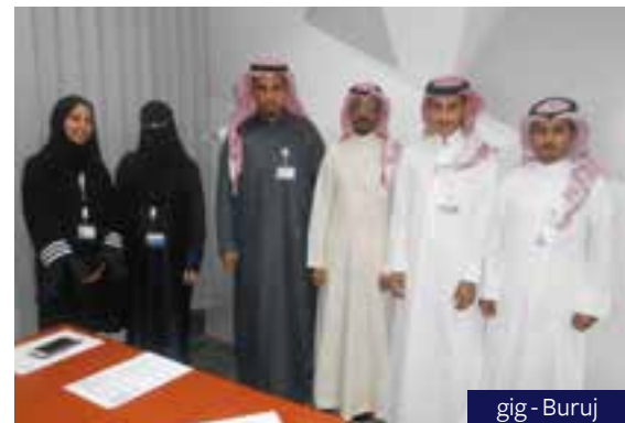
gig - Buruj