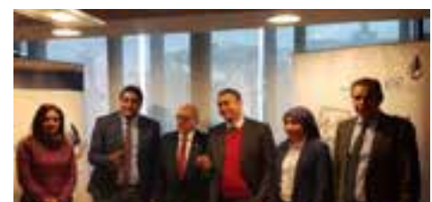
SME's Products Contest