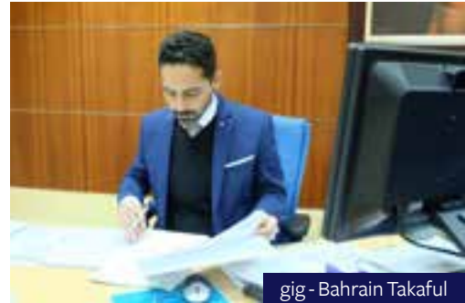
gig - Bahrain Takaful